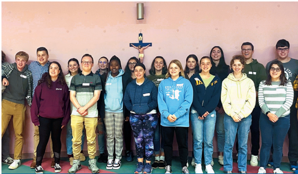
Campus Ministry 2023 Fall Retreat