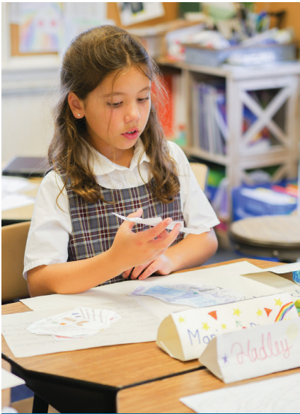
Saint John Regional School, Concord

This year, the NHCA provided necessary support to the system of Catholic schools so the mission of affordability, accessibility, and availability will advance. At the start of the 2023-2024 school year, enrollment in New Hampshire Catholic schools increased for a fourth straight year—and the demand for Catholic education remains high. The NHCA assists in funding important school infrastructure improvements and projects such as facility expansion, renovation, and revitalization. Funds will also be used in the areas of curriculum enhancements, financial assistance, leadership investment, and improved compensation and benefits for faculty.