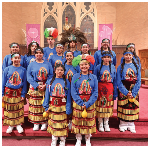
Feast of Our Lady of Guadalupe, Saint Aloysius of Gonzaga Parish, Nashua