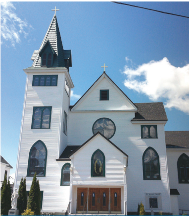
Saint Joseph Church, Lincoln

Our retired priests have given many years of service to the Lord and our communities in New Hampshire. Many of our retired priests are still actively involved in our parishes and communities and provide support to our seminarians. The Diocese of Manchester pays for benefits including health and dental insurance, housing, and monthly stipends.