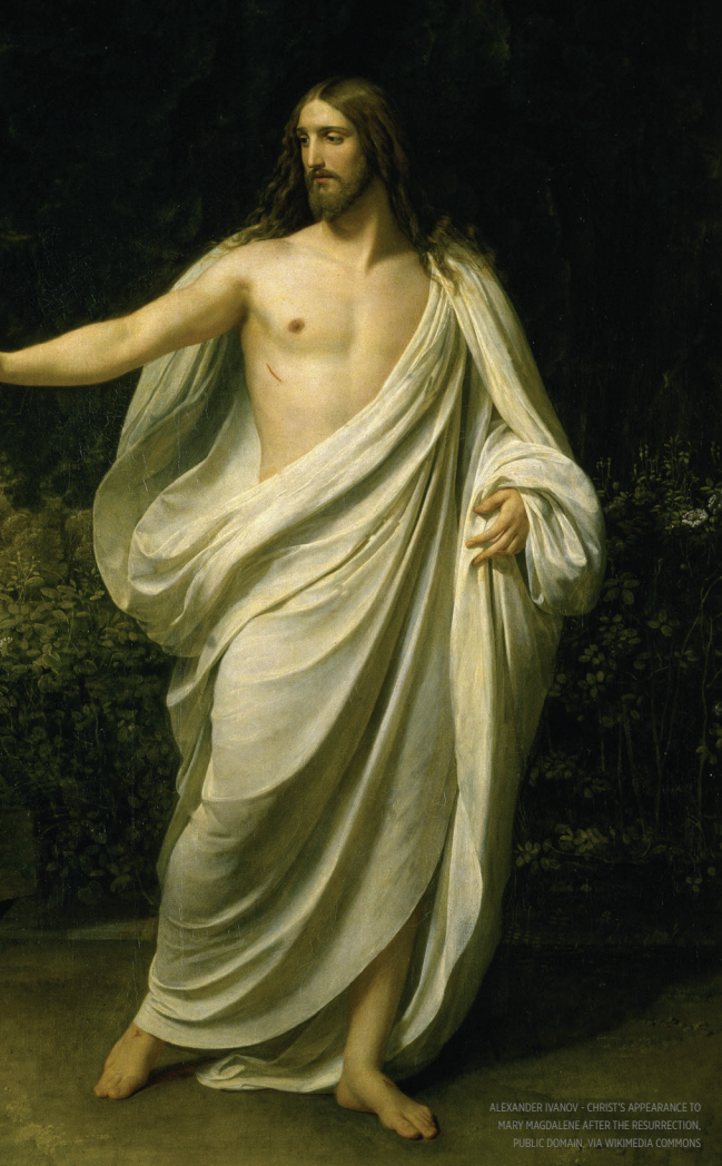
ALEXANDER IWANOV - CHRIST'S APPEARANCE TO MARY MAGDALENE AFTER THE RESURRECTION